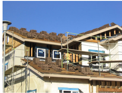
the reflectance of the tile to almost 45%. Fig. 1. The two A Style homes are loaded with Hanson's tile.

Dynamic Roofing has installed 30-lb felt paper, battens and has loaded both roofs of the A Style homes with Hanson's concrete tile (Fig. 1). The tiles have a dark brown color and are Hanson's low profile model H409 Hacienda concrete tile. A purchase order was let for Joe Riley of American Roof Tile Coatings to apply a topcoat finish to one of the two tile roofs. The topcoat contains CRCMs and will boost