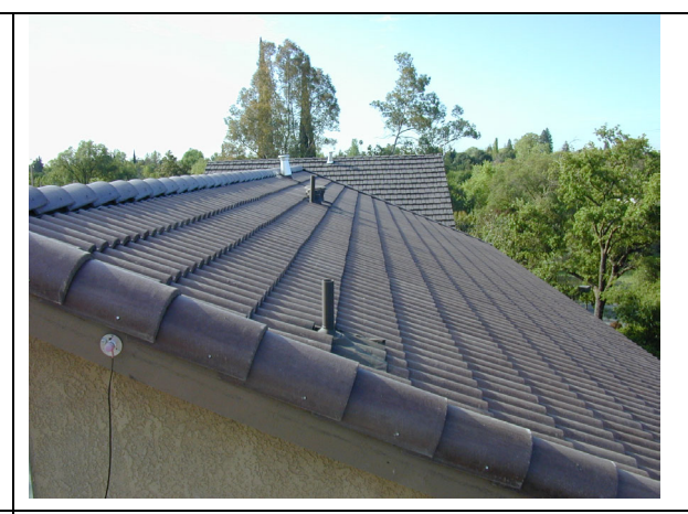
Fig. 3. Concrete tile roof with cool-colored coating from American Roof Tile Coatings.