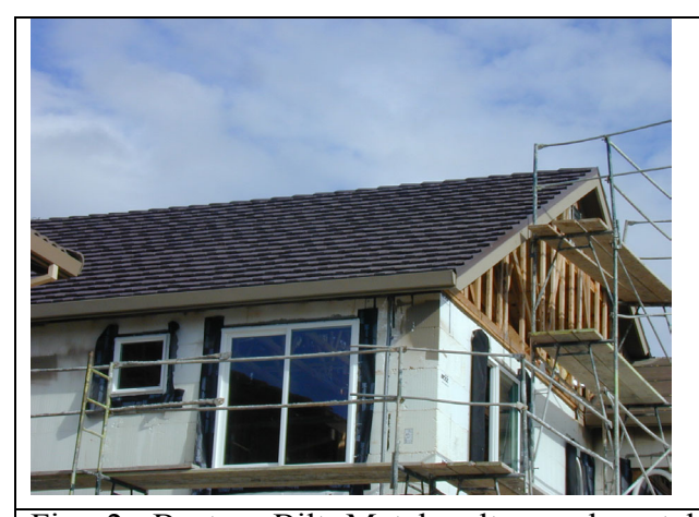
Fig. 2. Bustom-Bilt Metals ultra-cool metal shake was installed on the fourth demonstration house in Cavalli Hills.

Joe Riley of American Roof Tile Coatings and Lou Zumpano of Hanson Roof Tile applied a cool-colored topcoat finish to one of the two A-style homes having Hanson's concrete tile roof (location of A-style house with CRCM is highlighted in Fig. 1). Riley stated that the weather was perfect and they were able to successfully apply several topcoats. Pictures of the newest metal roof and the concrete roof with applied cool-colored coating are shown in Fig. 2 and 3 respectively.